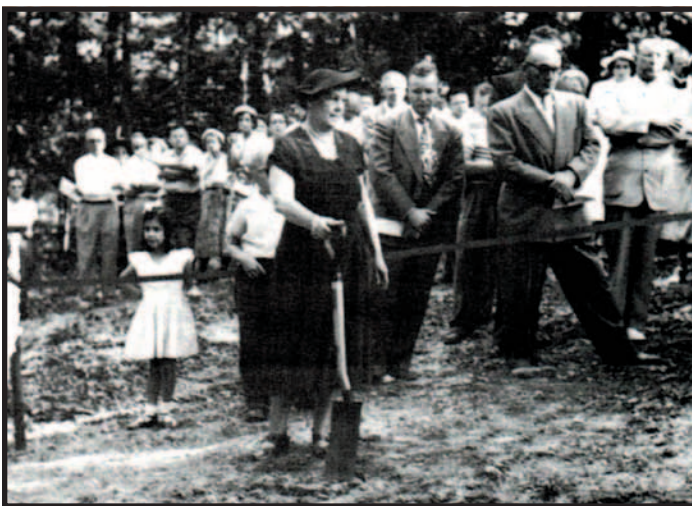
Groundbreaking of Efird Hall

The Heritage Campaign will include a $2 million goal for immediate projects and a $2 million goal for planned gift expectancies.