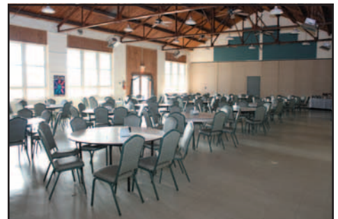
Lineberger Dining Hall

Lineberger Dining Hall: The dining hall serves more than 100,000 meals annually. Improvements are needed to make the building more energy efficient as well as more aesthetically pleasing to guests. New floors, windows, walls and doors will transform this space to reflect the hospitality experienced at Lutheridge and air conditioning will also be much appreciated by guests.