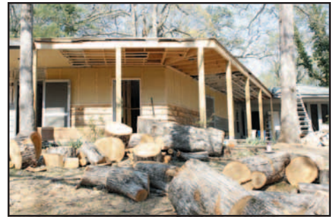
Mission Hall Apartments

Mission Hall Apartments: In late December 2009, fire severely damaged the Mission Hall Apartments that house year round and summer staff members. Insurance covered some of the cost, however, improvements were needed beyond insurance including a sloped roof, better insulation, efficient windows and HVAC to reduce annual operating costs.